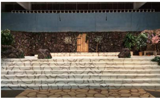
The drama was presented in this impressive setting.

The horror of the crucifixion was very realistically portrayed, but Jesus emerging from the tomb left the audience with the hope of Easter and the great love of our Lord.