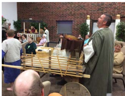
The market place in Jerusalem