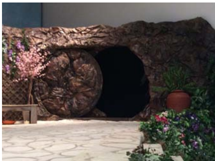
The stone was rolled away before the resurrected Jesus appeared.