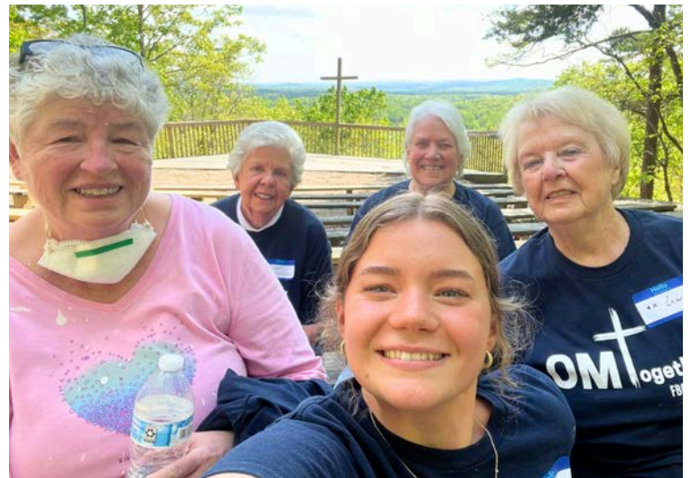
Hearts & Hands Clean-up at Mundo Vista