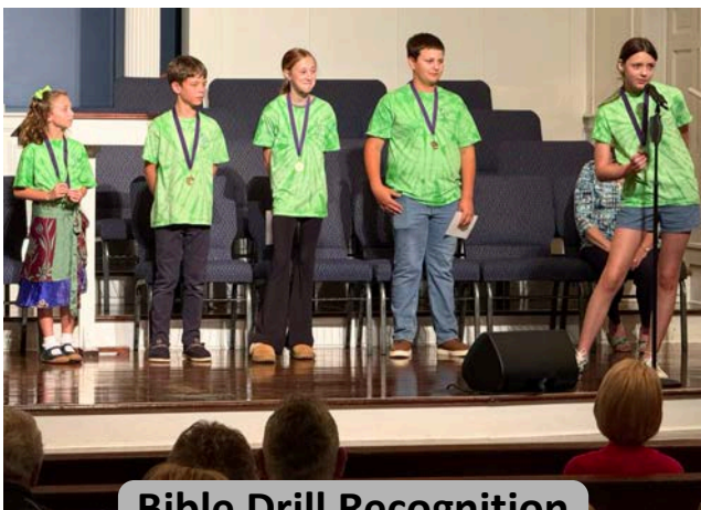
Bible Drill Recognition