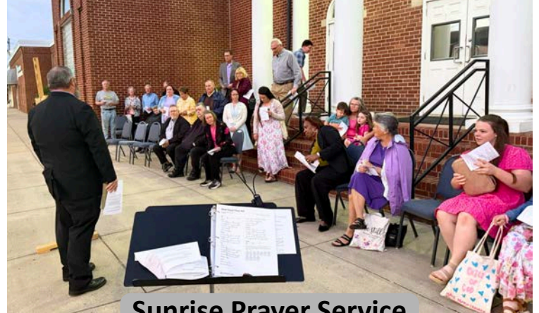
Sunrise Prayer Service