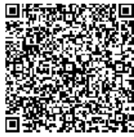
Children Participation Signup

We are excited to have our children, preschool—6 grade, lead us in worship on Sunday, March 15 during both worship services! In between services, there will be a time for families with children and children's volunteers to fellowship together over a hot breakfast. During the breakfast time we will have a devotional and worship. Please scan the QR codes to sign your child up to serve during worship and to save your spot for breakfast.